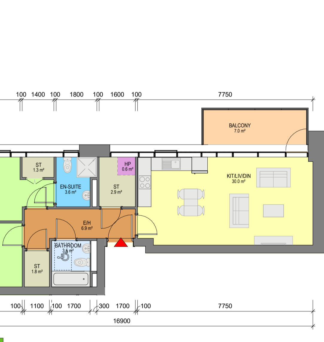
7 Apartment Type 2AQ 1 : 100 - 2 BED, 4 PERSON APARTMENT - NET INTERNAL AREA (NIA) Areas shown in plan - GROSS INTERNAL AREA (GIA) : 78.68sqm