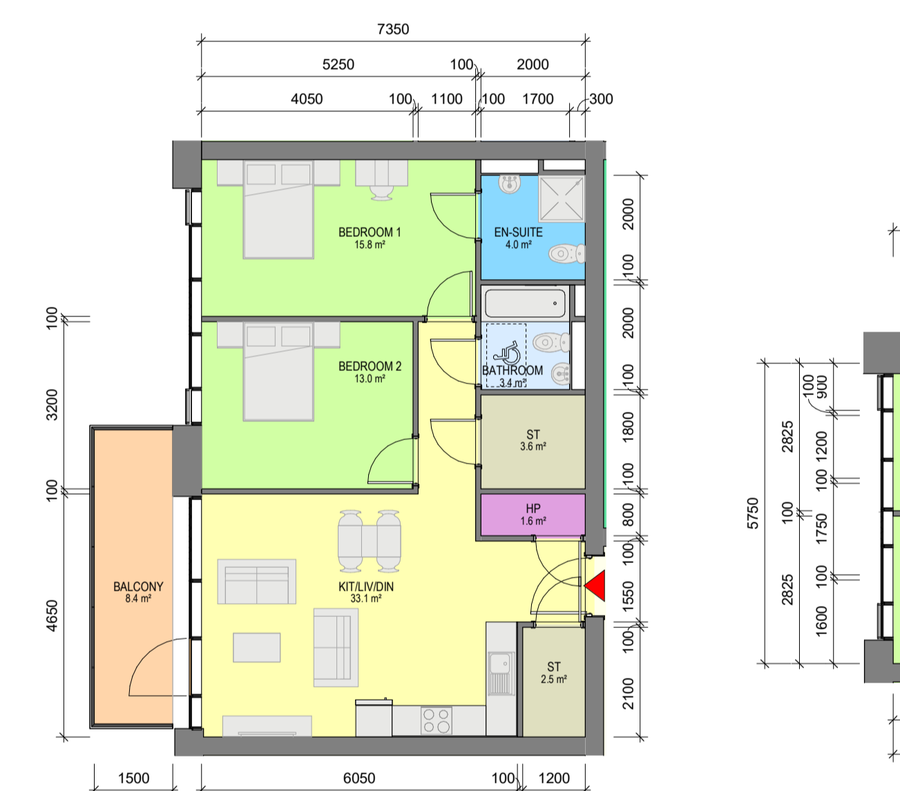
6 Apartment Type 2AP 1 : 100 - 2 BED, 4 PERSON APARTMENT - NET INTERNAL AREA (NIA) Areas shown in plan - GROSS INTERNAL AREA (GIA) : 81.22sqm