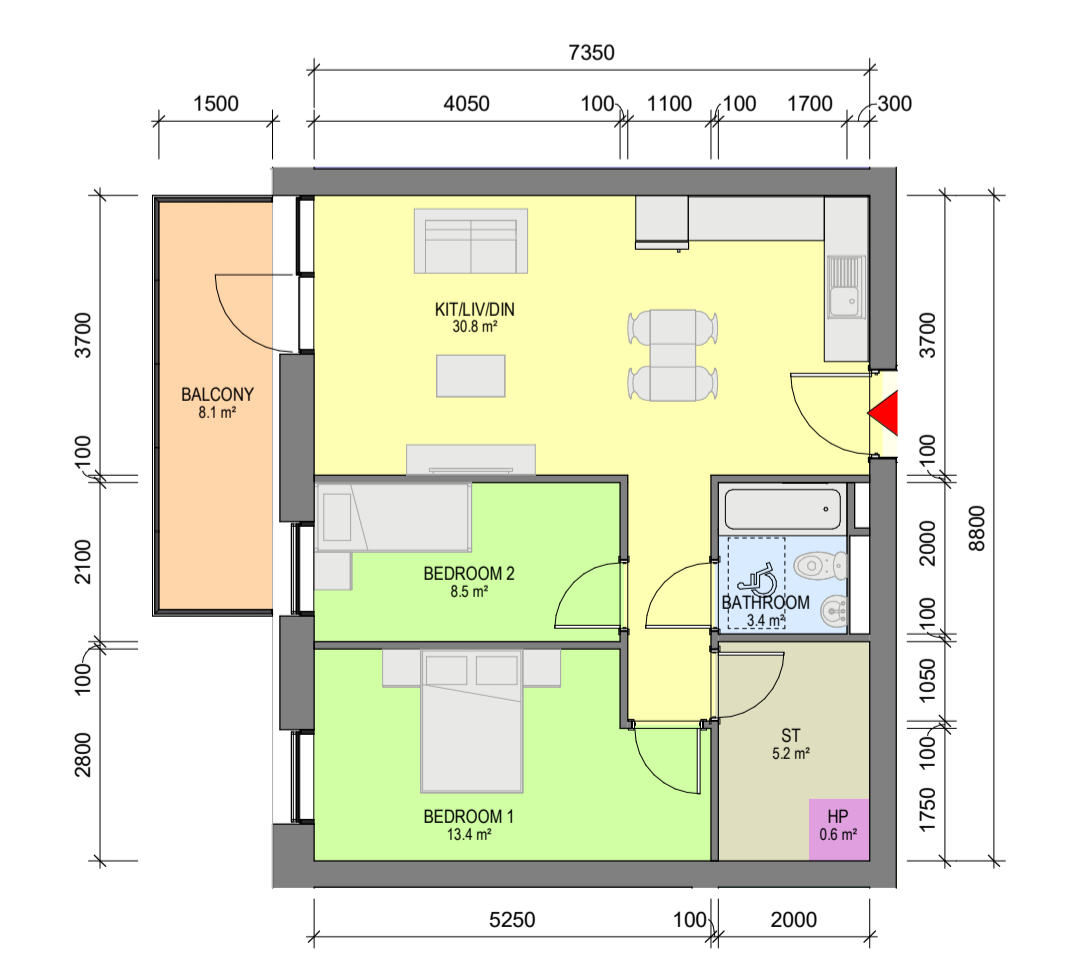
11 Apartment Type 2AU 1 : 100 - 2 BED, 3 PERSON APARTMENT - NET INTERNAL AREA (NIA) Areas shown in plan - GROSS INTERNAL AREA (GIA) : 64.68sqm