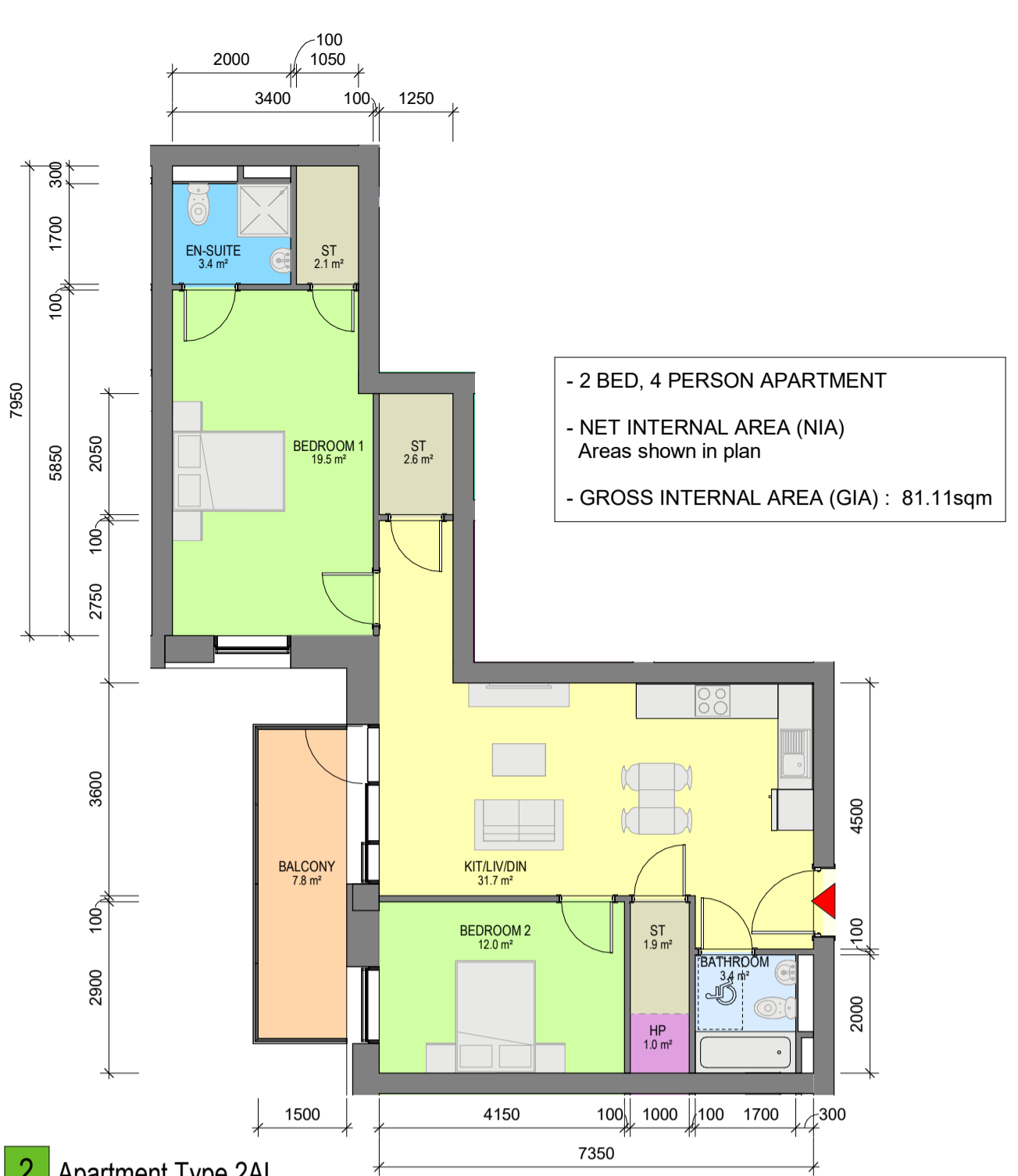
2 Apartment Type 2AL 1 : 100 - 2 BED, 4 PERSON APARTMENT - NET INTERNAL AREA (NIA) Areas shown in plan - GROSS INTERNAL AREA (GIA) : 81.1sqm