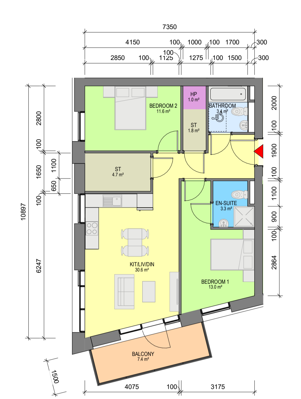
1 Apartment Type 2AK 1 : 100 - 2 BED, 4 PERSON APARTMENT - NET INTERNAL AREA (NIA) Areas shown in plan - GROSS INTERNAL AREA (GIA) : 73.36sqm