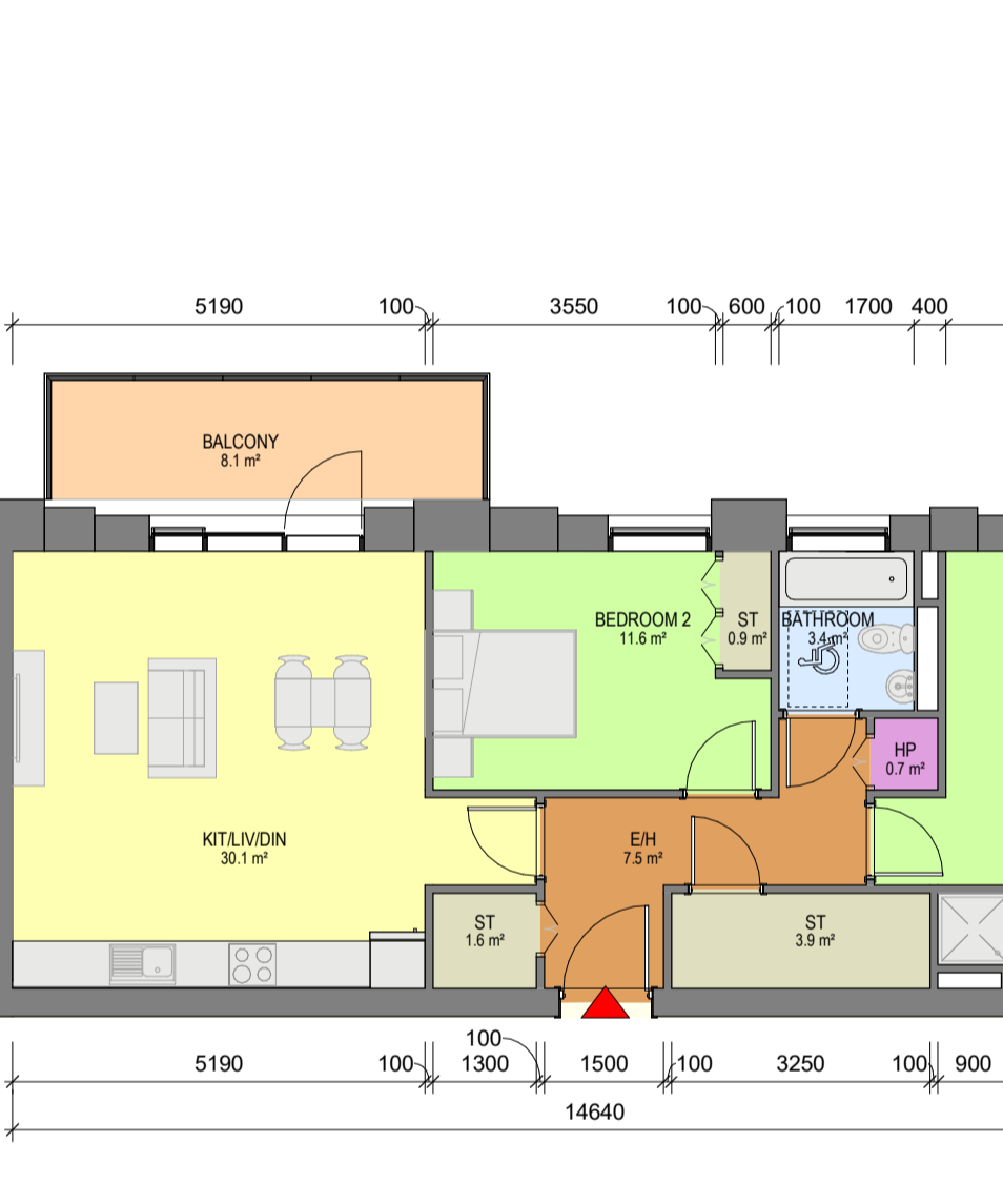
8 Apartment Type 2AR 1 : 100 - 2 BED, 4 PERSON APARTMENT - NET INTERNAL AREA (NIA) Areas shown in plan - GROSS INTERNAL AREA (GIA) : 80.52sqm