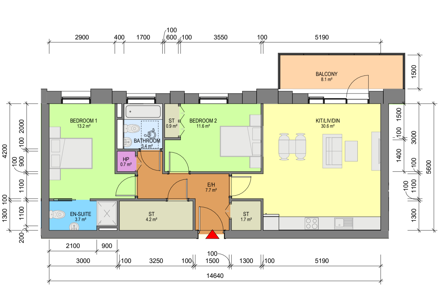
9 Apartment Type 2AS 1 : 100 - 2 BED, 4 PERSON APARTMENT - NET INTERNAL AREA (NIA) Areas shown in plan - GROSS INTERNAL AREA (GIA) : 81.98sqm

Status: A1 - Authorized and accepted for planning stage