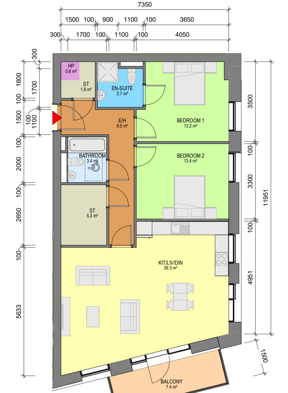
4 Apartment Type 2AN 1 : 100 - 2 BED, 4 PERSON APARTMENT - NET INTERNAL AREA (NIA) Areas shown in plan - GROSS INTERNAL AREA (GIA) : 94.41sqm