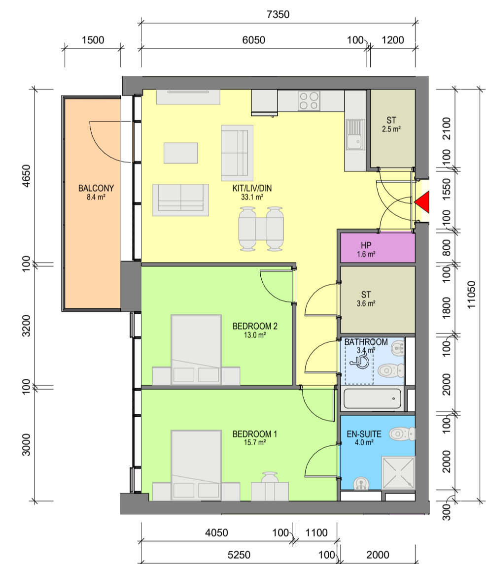
5 Apartment Type 2AO 1 : 100 - 2 BED, 4 PERSON APARTMENT - NET INTERNAL AREA (NIA) Areas shown in plan - GROSS INTERNAL AREA (GIA) : 81.18sqm