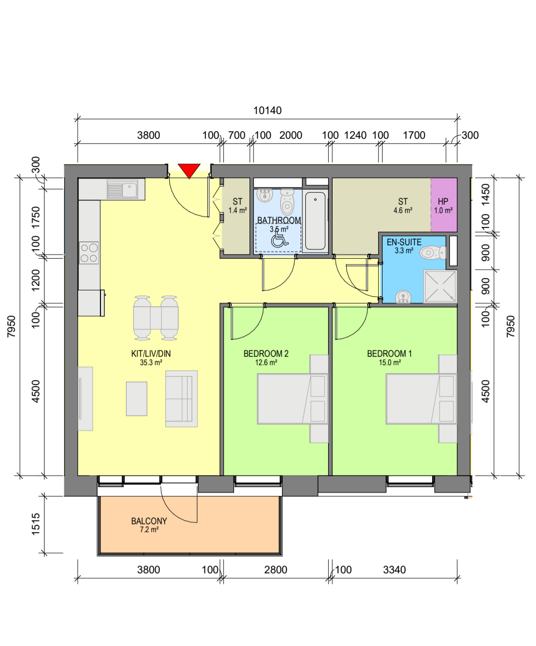
3 Apartment Type 2AM 1 : 100 - 2 BED, 4 PERSON APARTMENT - NET INTERNAL AREA (NIA) Areas shown in plan - GROSS INTERNAL AREA (GIA) : 80.61sqm