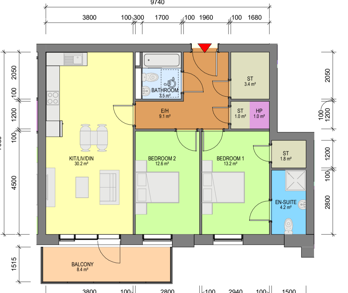
10 Apartment Type 2AT 1 : 100 - 2 BED, 4 PERSON APARTMENT - NET INTERNAL AREA (NIA) Areas shown in plan - GROSS INTERNAL AREA (GIA) : 83.99sqm